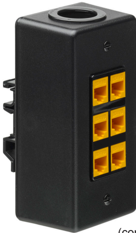
(connectors sold separately)

The compact QuickPort 6-Port DIN Rail-Mount Box provides an ideal network patching solution for industrial automation and control panels. The box includes a Leviton QuickPort Decora 6-port Insert, and allows for orientation of the 1-3/8 inch cable access port at the top or bottom, thereby increasing flexibility of cabling within a tight control enclosure. The box depth is suitable for Cat 5e or Cat 6 applications.