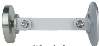
3" Extension Bar