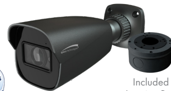
Included Junction Box