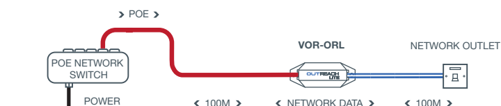
Diagram 2. If there is no POE available, upgrade the link with Veracity's low cost POE injector OUTSOURCE.

Diagram 1. OUTREACH Lite is powered by POE, so it can double Ethernet range without requiring a local power outlet.